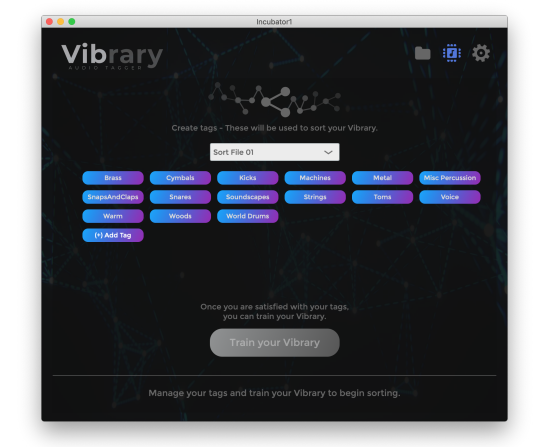
Fig. 2: Screenshot for part of the dataset creation process, where tags are both suggested by the system and added by the user.